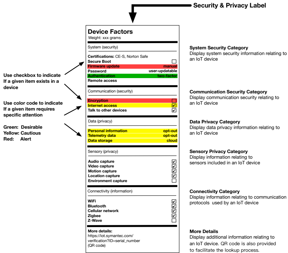
Fig. 1: Candidate visual layout 1: leverage the design concepts of food nutrition facts.