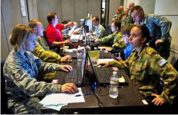
The Red Flag 14-1 Cyber Protection Team works on cyber defense procedures inside the Combined Air and Space Operations Center-Nellis, Nellis, NV. The CPT's primary goal is to find and thwart potential space, cyberspace and missile threats against U.S. and allied forces.

planned release of a satirical film, North Korea conducted a cyberattack against Sony Pictures Entertainment, rendering thousands of Sony computers inoperable and breaching Sony's confidential business information. In addition to the destructive nature of the attacks, North Korea stole digital copies of a number of unreleased movies, as well as thousands of documents