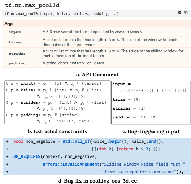
Figure 1: TensorFlow document helps our tool detect a bug that was fixed after we reported it to TensorFlow developers.

the API function. To test as_strided 's core functionality, a testing technique needs to generate a tensor object for the input parameter.