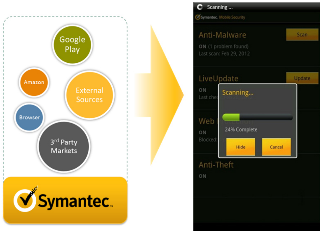
Figure 2: On-device Antimalware Scanning